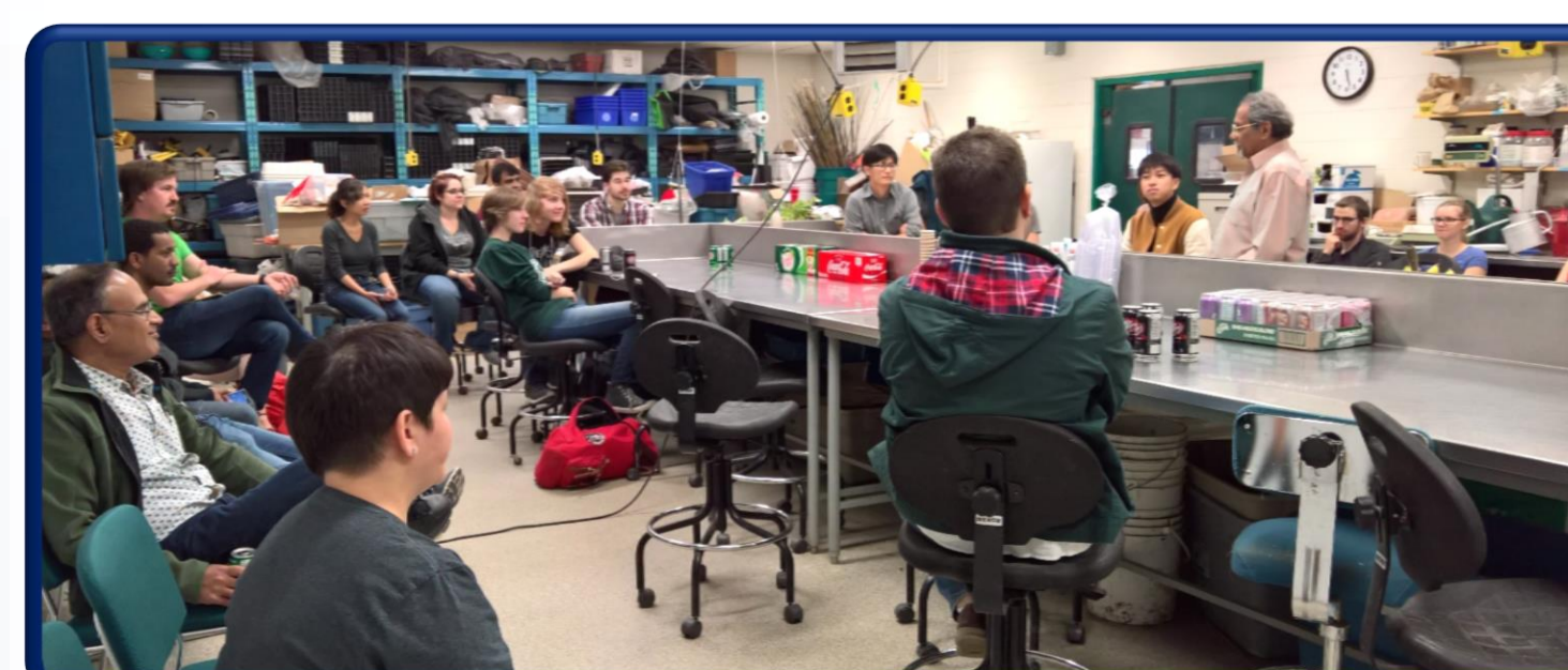
Agriculture Greenhouse of the University of Saskatchewan, September, 2017