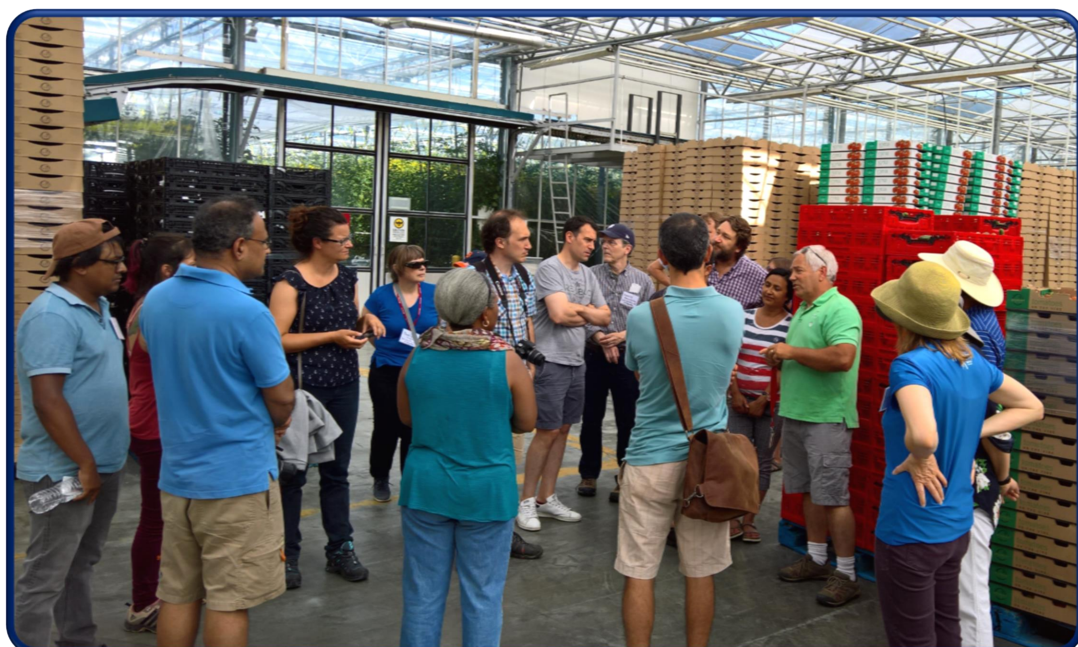
Tour of Windset Farms, one of the largest greenhouse operations in North America, part of "Plants from sea to sky" conference in Vancouver, July 2017