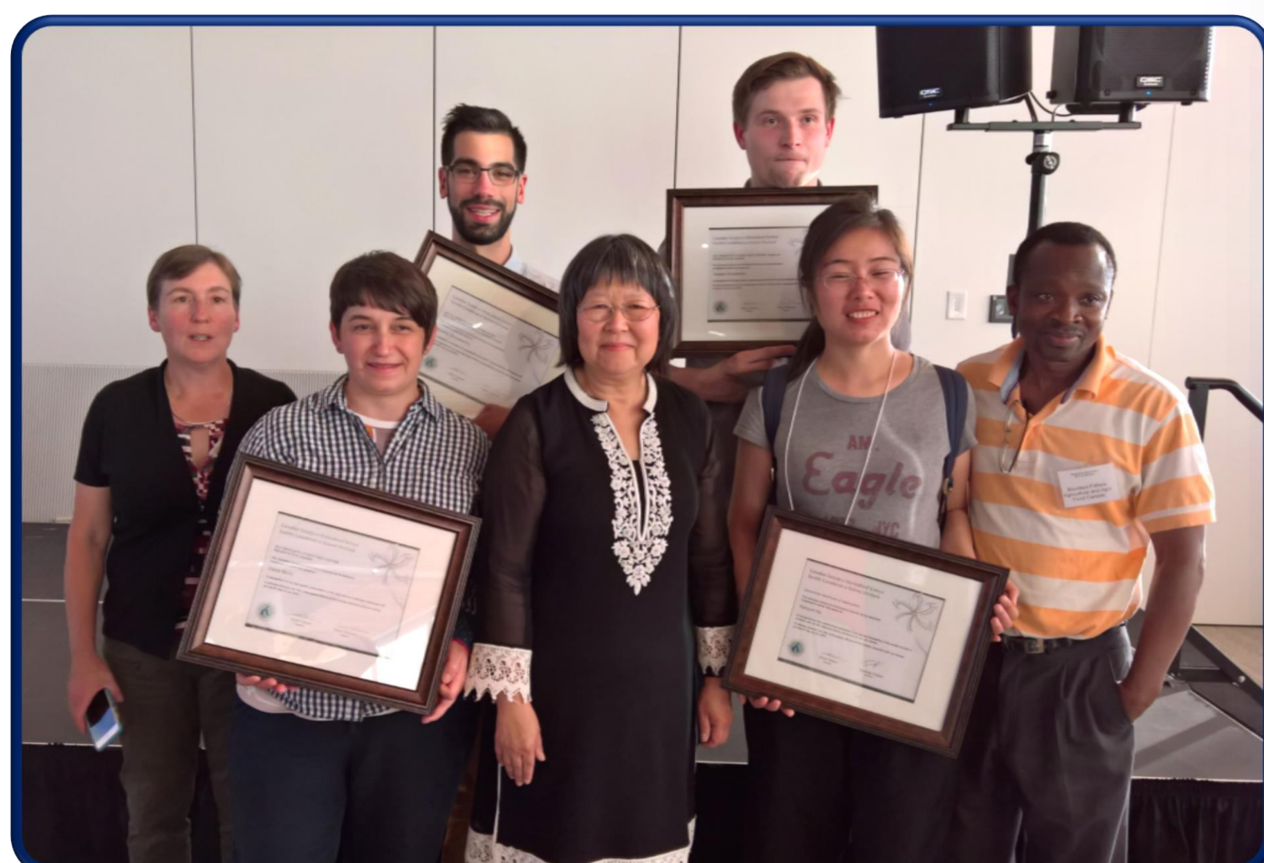
Gala of Awards for oral, poster presentations and runners up in Vancouver at "Plants from sea to sky" annual Conference, July 2017